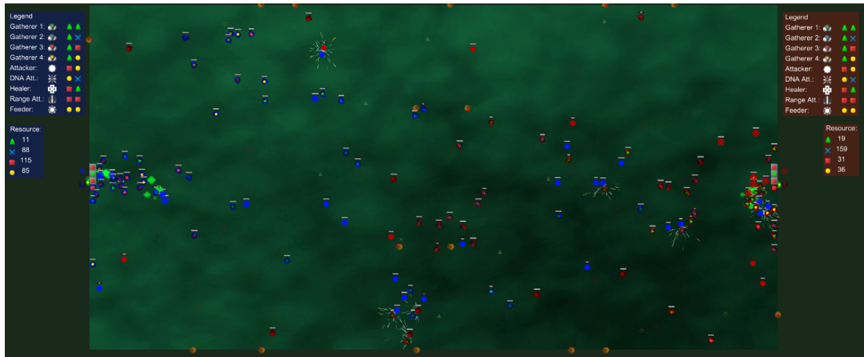
Figure 2: The game from 20.04.2015.