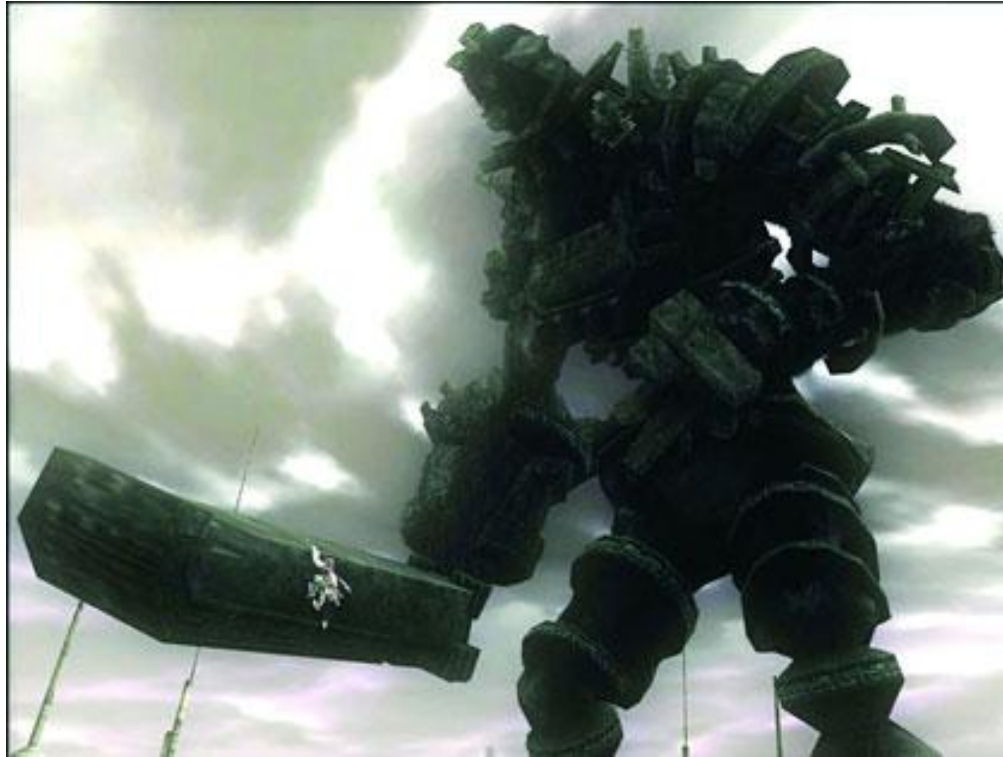
Shadow of the Colossus (PS2)