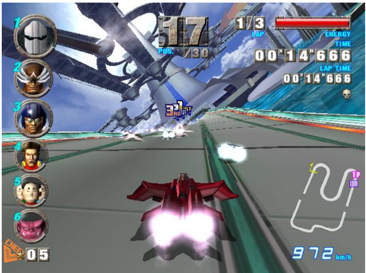
Abbildung 2: F-Zero GX, Gamecube