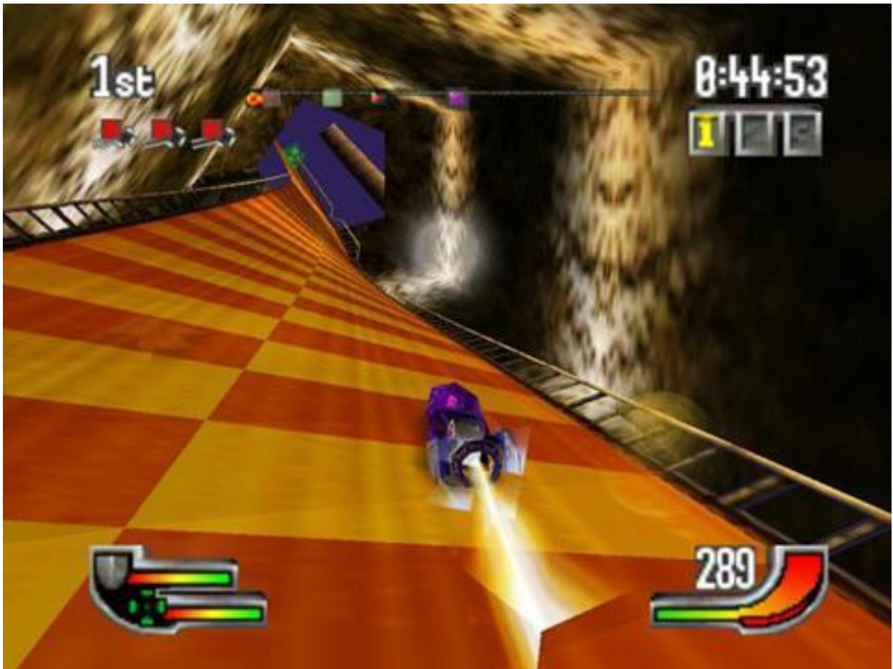
Abbildung 3: Extreme-G, Nintendo64