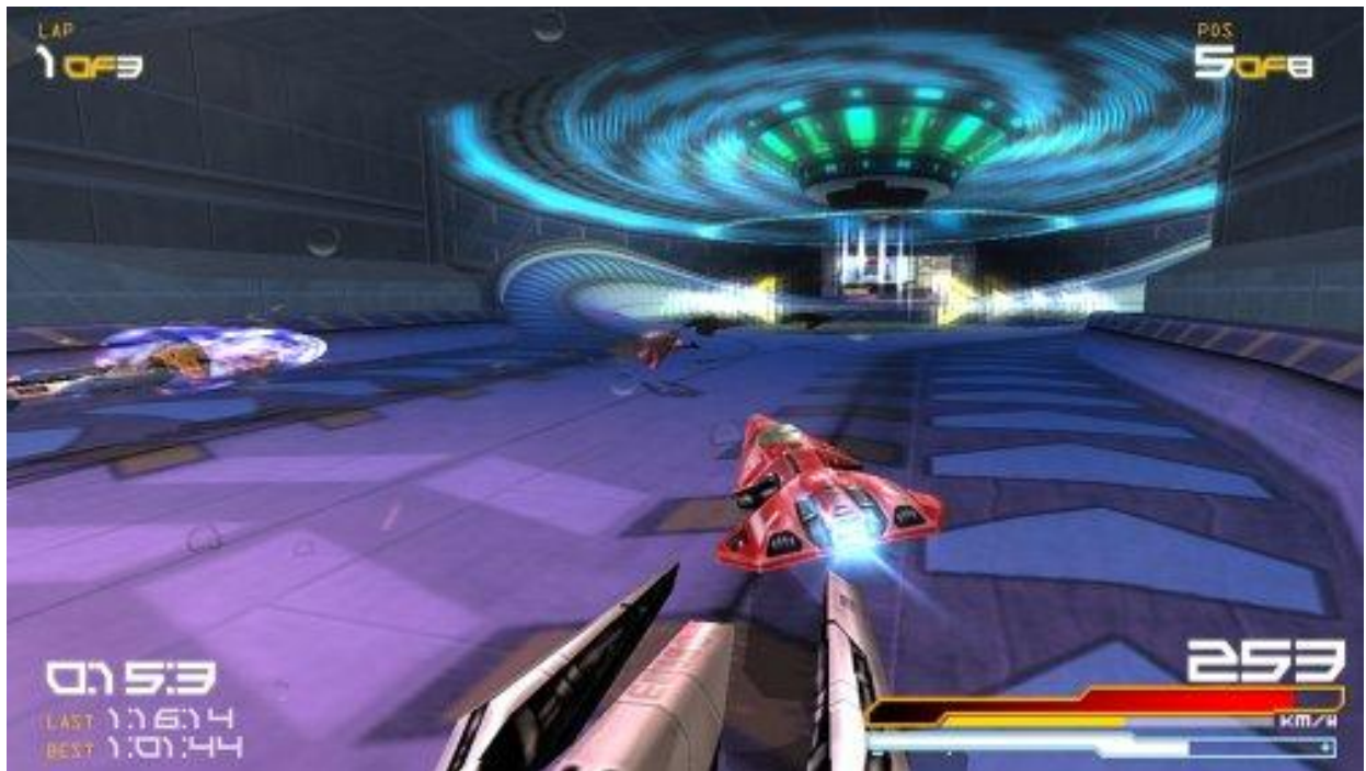
Abbildung 1: WipeOut Pure