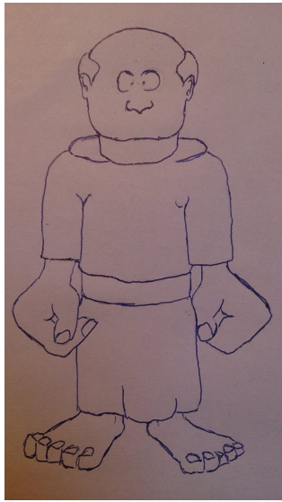
Figure 2: Creationist