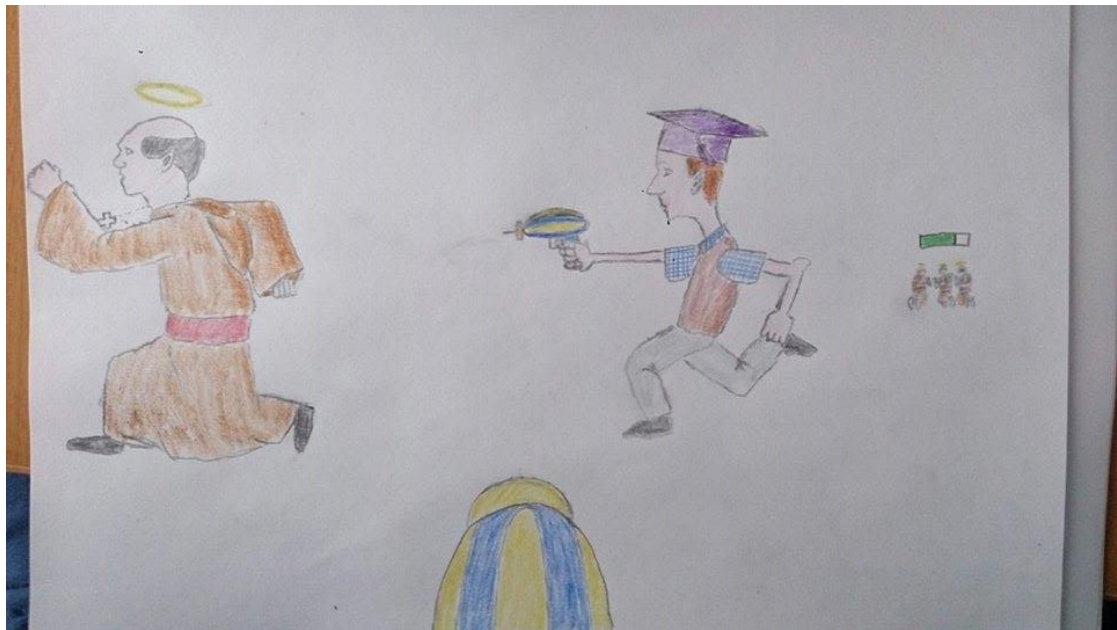
Figure 1: Battle of Origins | Theory Defender